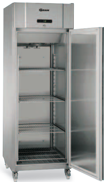
Robust construction, high specification The external front and side walls, inside of the door and shelf wall rails are stainless steel.