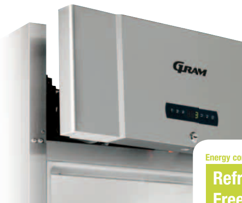
Easy maintenance and service There is easy access to the replaceable dust and grease filters. The compressor and refrigeration system is housed in the unique easy to service Gram plug-in unit.