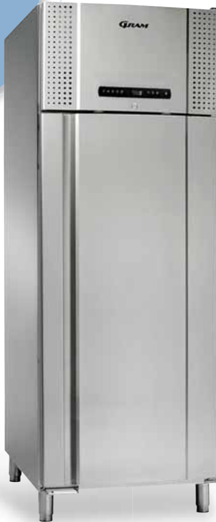
Plate size 60 x 80 cm 60 x 40 cm