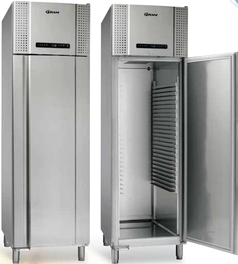
Plate size 60 x 40 cm